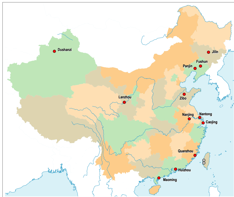
Figure D.2 Location of SBR Plants in China